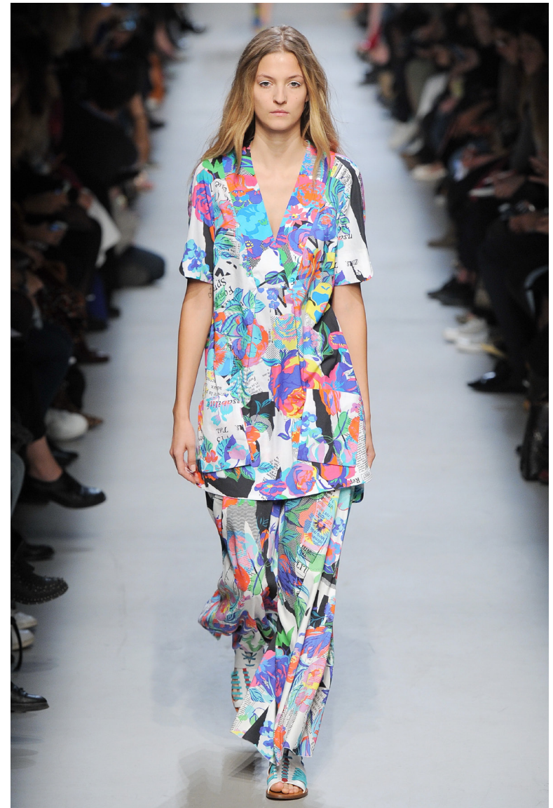
Leonard, Spring/Summer 2016